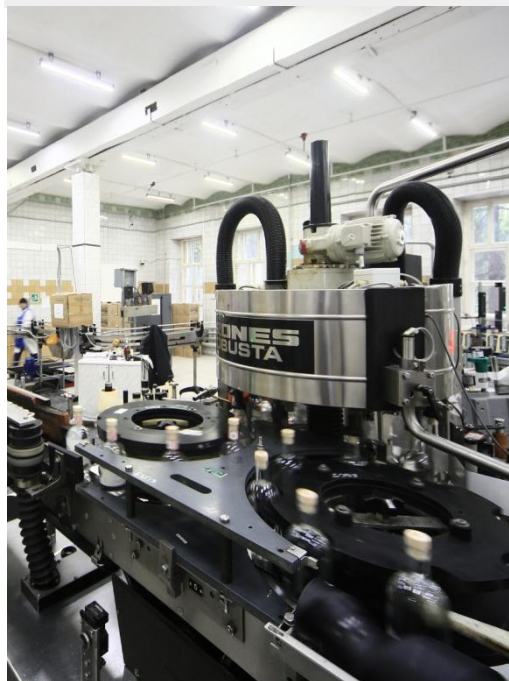
Two bottling shops equipped with 6 bottling lines