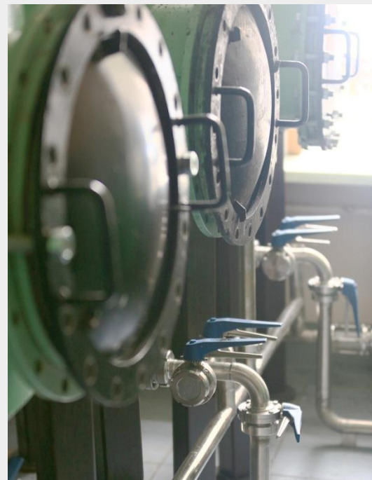
Vodkas processing shop with 6 coal filtration batteries