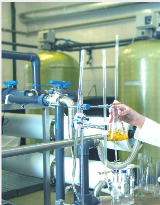
Division of water processing