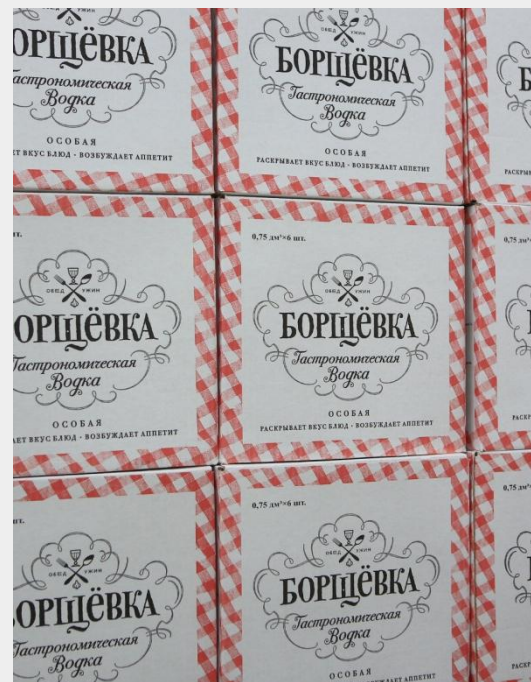
Ready products warehouse