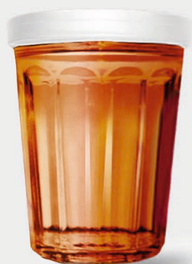
Smoked pepper & honey