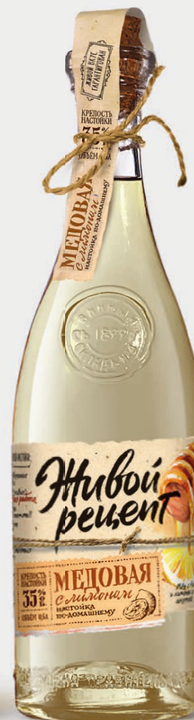
Honey with lemon