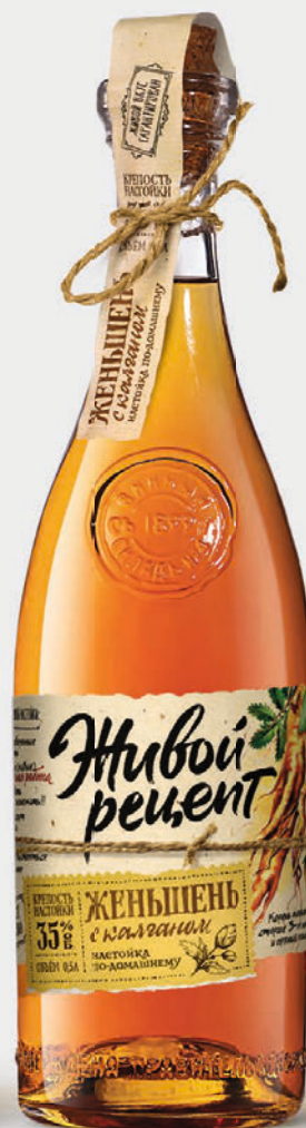
Ginseng with galangal