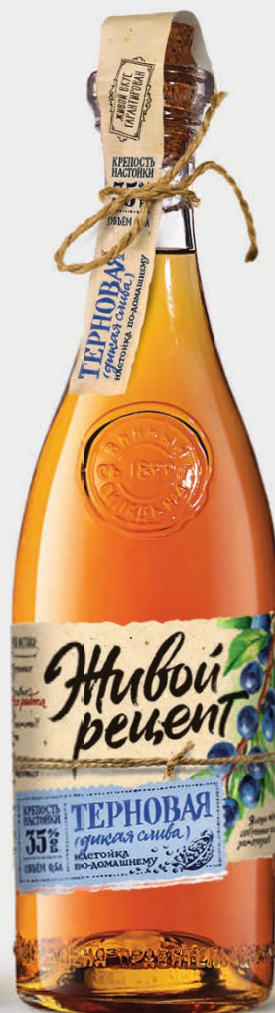
Blackthorn (wild plum)