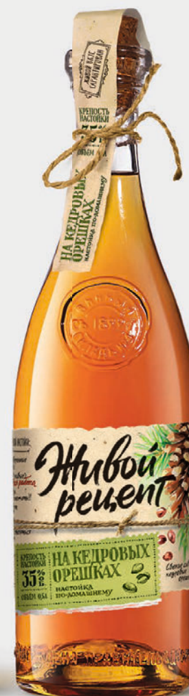
On cedar nuts